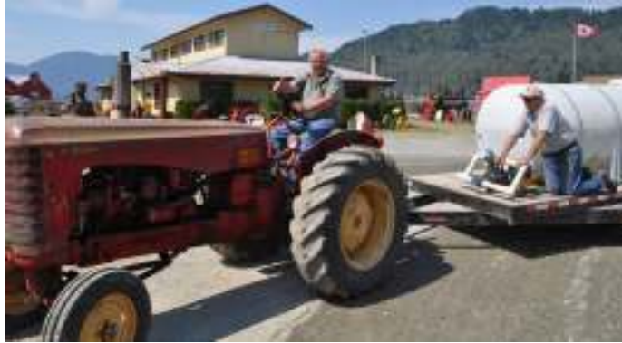
Water Boys keeping the Dust down

!!!! TO RECEIVE THESE PICTURES IN COLOUR, PLEASE GIVE THE EDITOR YOUR E-MAIL ADDRESS !!!!