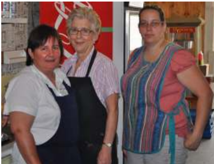
The Three Musketeers