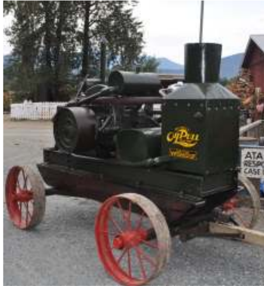
A real Rumley!