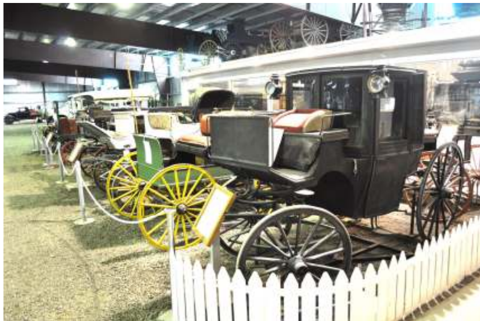
Buggies galore in our Museum!

It turned out that the Board had so much business to discuss that another Board meeting had to be held the next Tuesday to finish all the items to be discussed in time for the AGM on November 12th. At that meeting, some changes were made to charges for use of the site and parts thereof. Some changes were made for adoptions, and the new policies will be added to the adoption forms.