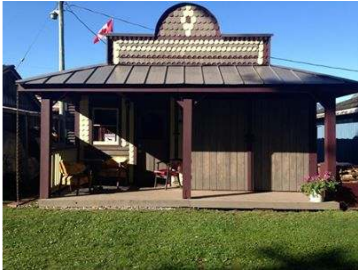
Dwayne & Bev Huseby's spruced up cabin