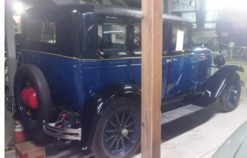
1928 Canadian-built Pontiac