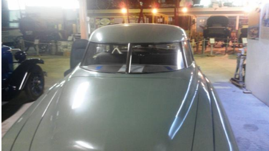
Is this an airplane? – 1947 Studebaker