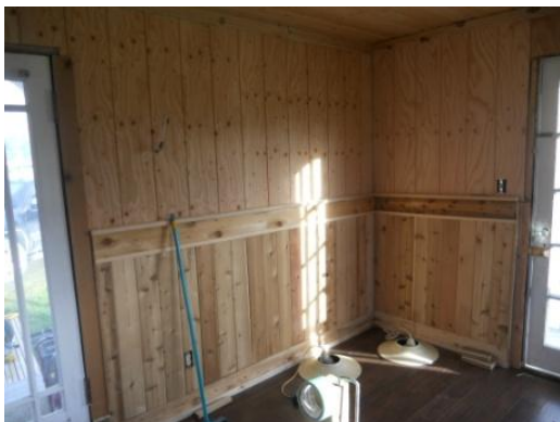
Interior work underway