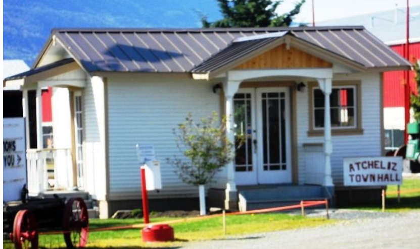
The completed building