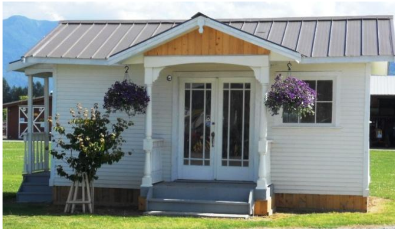
Exterior almost complete