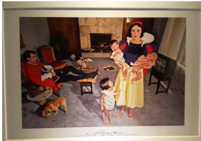
The end of the dream

The picture below was actually on the wall of a room at the Burrard Hotel by St. Paul's Hospital!