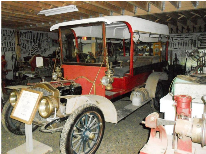
Our 1908 Russell side-curtain van