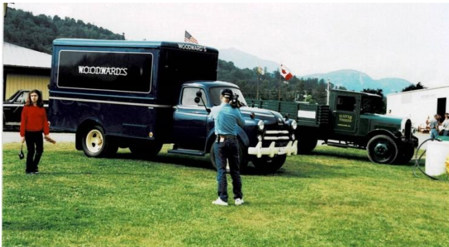
The Woodward's truck and the 1931 Hayes-Anderson

On May 23 rd we put some pictures of our 1954 Dodge Woodward's truck on our Facebook page. We got the largest number of people reached since we started the page, 1225!!! Here's a couple of the photos.